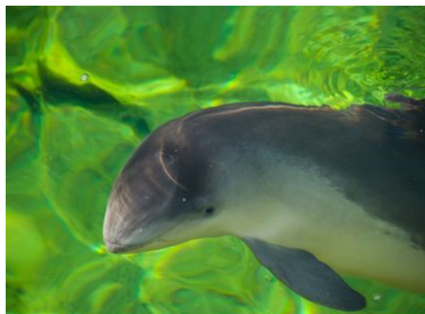
A porpoise is smaller and more shy than a dolphin. It has a rounded snout.