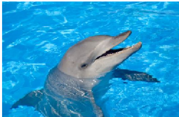
A dolphin is a social animal with a pointed beak.

Both porpoises and dolphins are toothed whales. However, porpoise teeth are shaped differently than dolphin teeth. Dolphins have sharp, cone-shaped teeth, but porpoise teeth are spade-shaped and flatter.